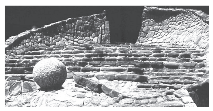
Figure 2. Friendship Park, Vladivostok, Russia.

This participatory process offers an extraordinary opportunity to explore important lessons of citizenship and democratic