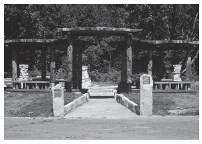
Figure 8. Salishan Gathering Place, Tacoma, WA.