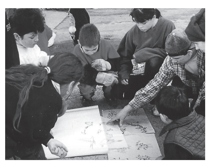
Figure 1. Design Workshop, Terrace Hill, Redmond, WA.