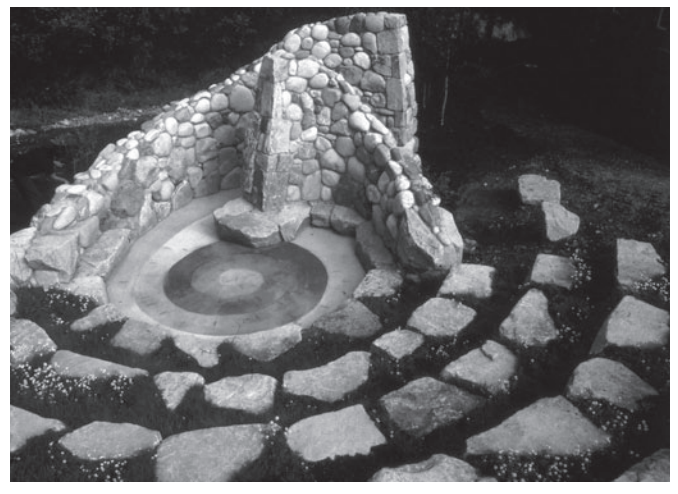
Figure 7. Terrace Hill bus shelter, Redmond, WA.