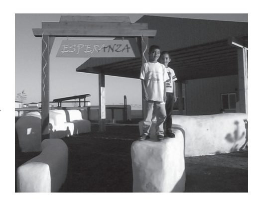
Figure 3. Strawbale wall at Esperanza Gathering Place, Mattawa, WA.

better relations among neighbors, reduced vandalism and crime, increased safety for children, renewed volunteerism and stewardship, and more everyday beauty.