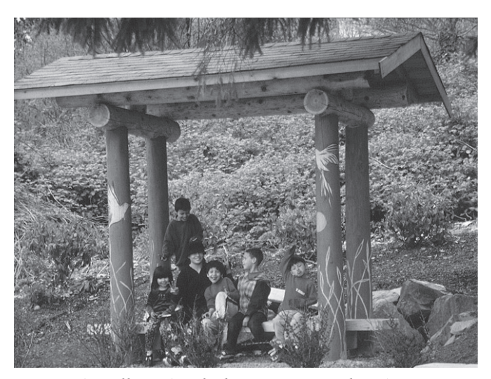
Figure 6. Kelkari Amphitheater, Issaquah, WA.