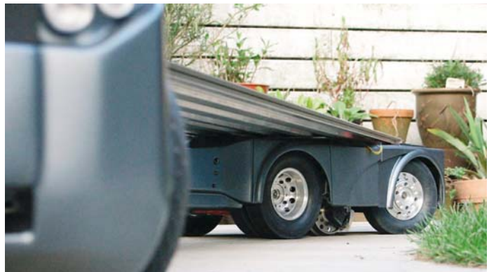
As both front and rear modules mimic each other, there is no cut in on corners.

and sensor systems can prevent vehicles colliding. Thus you could have a single ribbon of steel running from London to Edinburgh. Because the vehicle is basically only using the rail wheels for load carrying wear on the track is minimal.