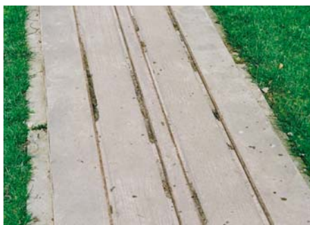
The test track for the scale model shows just how simple the infrastructure needs to be.

So why bother with rail wheels at all? Economy. Rail wheels running on rails have only 20% of the resistance of tyres running on road so the vehicle can be operated much