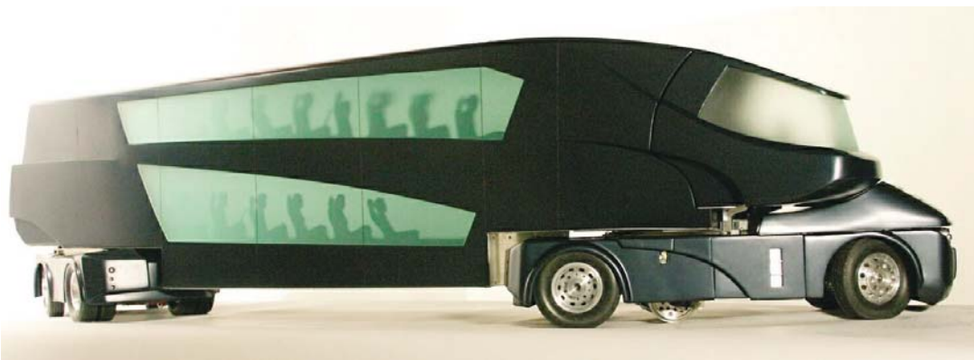
BladeRunner would be capable of carrying 105 passengers in comfort at speeds of 100 miles per hour.

The heart of the system is the ability for the front and rear motive units to precisely track each other so that if the front goes around the corner so will the back in exactly the same track. Self steering bogies are not new, they've been used on trailers for over 60 years, but they have always had a weakness in that they can only really be used at slow speeds. Once the vehicle is going at speed the steering wheels have to