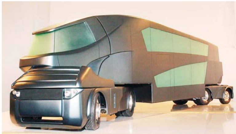
BladeRunner may look unconventional but it has the possibility of answering many of the transport problems in the developed world.

dedicated formation you can suspend electric wires over it and give the vehicle the option to be powered by electricity which is far more economical, offers the option of regenerative braking and can also be used to recharge batteries. As you now have the vehicles operating on a dedicated formation you can also introduce obstacle sensing so