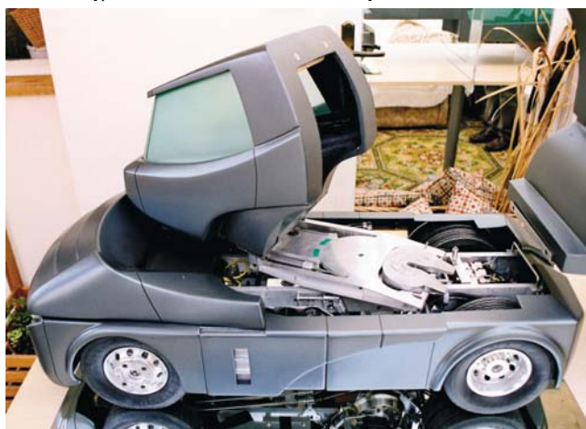
Although the unit has a fifth wheel coupling, this is used only for locating the load carrying module.

At first it appears that the vehicle is a conventional artic with a fifth wheel coupling and indeed it does have a fifth wheel, but that is only for locating the load carrying module allowing it to be easily disengaged for maintenance. In the lowered position it does not carry any load or perform any other function. The actual turning motion for both the powered front module and the rear module is carried out by turntables. Even the driver's cab is independent of the chassis and can thus be locked up to the load carrying unit, removing the normal gap between cab and trailer and its attendant problems of unstable aerodynamics.