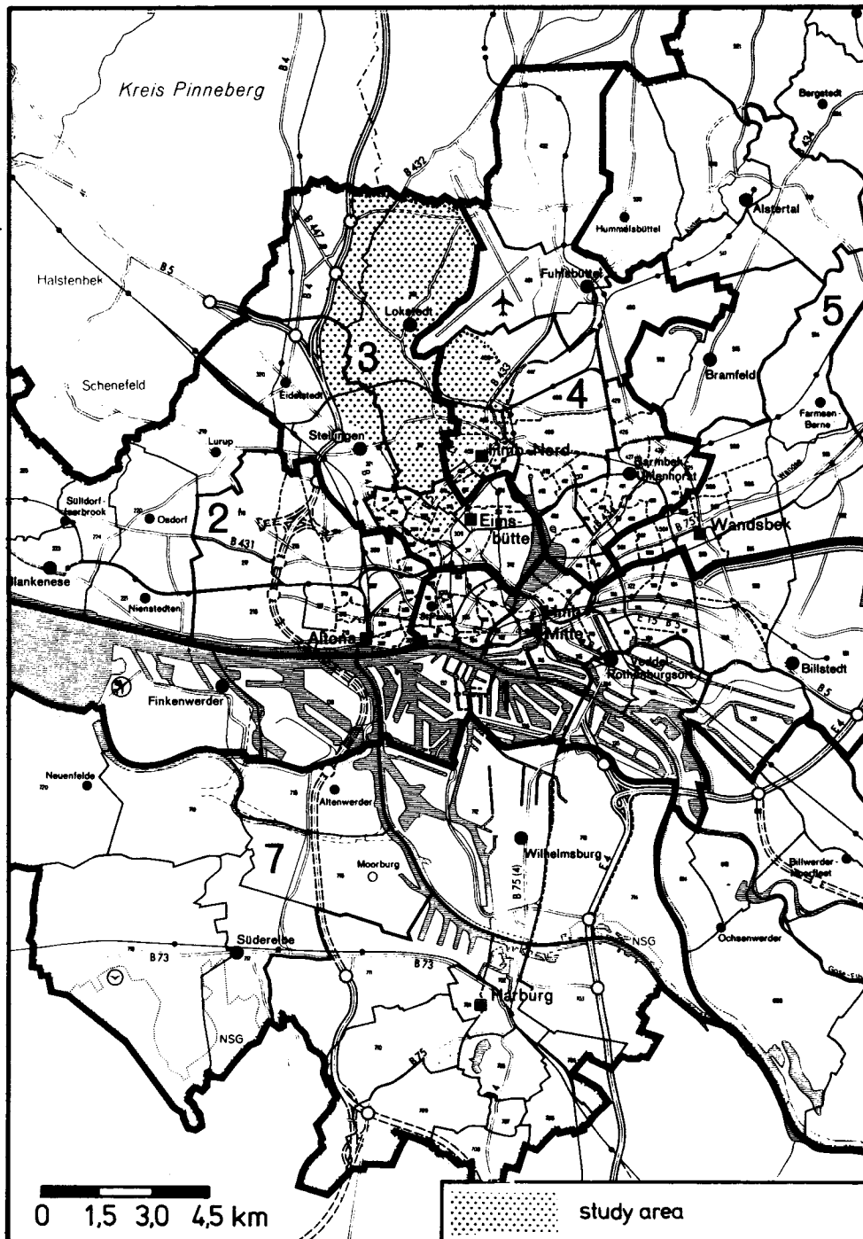
Fig. 3.0-1: Hamburg and the study area

At the time of the investigation no data pertaining to the study area were available, as they are needed for the transport forecast program. Therefore, a separate transport forecast calculation had to be prepared on the basis of structural data for the entire Hamburg area, using information supplied by the Statistisches Landesamt (Hamburg Statistical Office).