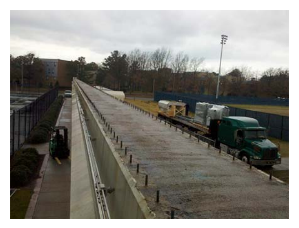
Figure 5. Guideway before installation

U.S. Department of Transportation Federal Railroad Administration