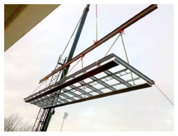
Figure 4. Crane lifting stator and rail module

An important part of the project was to develop a cost effective method of constructing the LSM and suspension components and installing them on the guideway beams. This was achieved by constructing 12 meter long sub-assemblies in Devens MA and shipping them to ODU via truck. The assemblies were then lifted by a crane and installed on a guideway that had been prepared to receive them. Figure 4 shows the crane lifting one sub-assembly, Figure 5 shows the guideway before the LSM and suspension components were installed, and Figure 6 shows the guideway after the LSM and suspension components were installed.