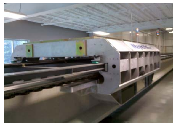
Figure 3. Test sled on guideway in Devens, MA

M3 uses a permanent magnet suspension and Linear Synchronous Motor propulsion. The design uses lightweight vehicles and a wide gap (20 mm) suspension so it could operate successfully on the existing guideway. The M3 design was first tested on an indoor guideway at MagneMotion in Devens, MA using beams designed to replicate the ones used at ODU. Figure 3 shows the test vehicle operating on the Devens guideway.