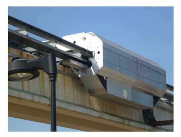
Figure 1. M3 vehicle on the ODU guideway

MagneMotion and Old Dominion University undertook a cooperative agreement to demonstrate the MagneMotion M3 urban maglev technology on an existing elevated guideway on the ODU campus in Norfolk VA. M3 was designed for urban applications with speeds up to 100 mph, acceleration up to 1.6 m/s<sup>2</sup>, and a 60 foot turn radius. Figure 1 shows the "sled" vehicle on the ODU guideway. This vehicle was weighted to simulate the operation of one section of an operational vehicle. This project involved constructing and testing the suspension and propulsion system with the objective of demonstrating M3 is a viable alternative for urban transport, both in performance and cost.