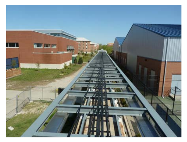
Figure 6. Guideway after installation