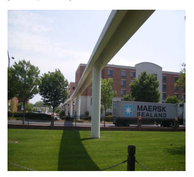
Figure 2. Existing ODU guideway

ODU has an elevated guideway, shown in Figure 2, constructed for an urban maglev design that was never able to operate because of interactions between the vehicle and the guideway causing beam resonances.