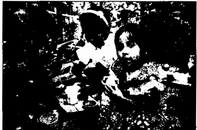
Lilia and Griselda Sánchez Cruz play house in the garden beside their home in San Juan Mixtepec. Children learn about plants from a very early age as they accompany their parents and elder siblings at daily chores.

ridges above 3 700 m. These forests are broken here and there by limestone cliffs, natural meadows on saturated soils and scattered high-elevation "ranchos" devoted to fruit tree cultivation (e.g., Crataegus pubescens [H.B.K.] Steud.), cold adapted corn ( Zea mays L., Poaceae), faba beans ( Vicia faba L., Fabaceae), potatoes ( Solanum tuberosum L., Solanaceae), chilacayote ( Cucurbita ficifolia Bouché) and oregano ( Origanum vulgare L., Lamiaceae). To date San Juan's forests have seen little commercial logging due to widespread community opposition. Magnificent pristine forests are found within an hour's walk above the town.