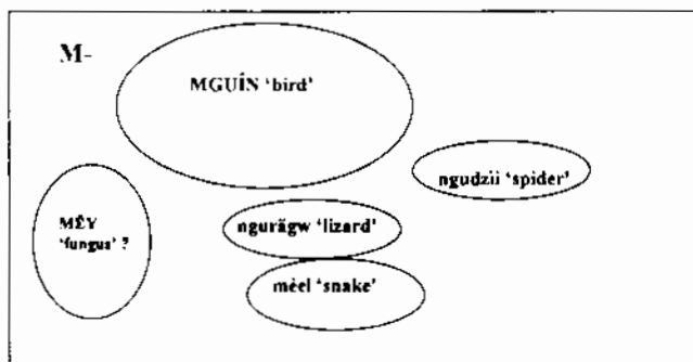
Figure 3 Venn Diagram of Mixtepec Zapotec Animal Life-Forms

Less than a dozen bird generics have binomial names on the plant model. Most are named as is the raven ( Corvus corax ): ngä , in imitation of its call. A large number of insects—45 of 129 (35%) non-Spanish derived generics—are called má-X , but those so named do not form a well-defined set. We have decided to treat most categories named má-X as generics, although most resemble folk specifics or varieties psychologically more than they do generics. That is, má-X typically singles out a particular colour, pattern, host plant or habitat that distinguishes the organism from others like it. Moreover, many such taxa are heterogeneous, e.g., má-pint "pinto bug" includes a variety of small spotted beetles; má-dán "forest bug," a variety of beetles found in forest habitats; and má-lò-guizh "bug of herbaceous plant," a range of herbivorous insects.