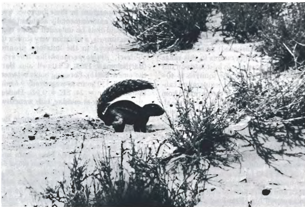
FIG. 1.—Use of the tail as a sun shade by the Cape ground squirrel ( Xerus inauris ). Top , The erected tail covers the entire dorsal surface of a sitting animal. Bottom , The tail is held erect over the back of a horizontal squirrel. Note the shading of the body and head.