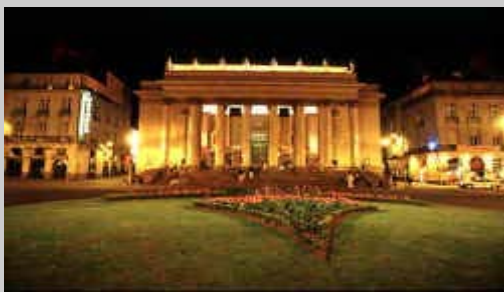
The Théâtre Graslin, Nantes's opera house

The minimum requirement for this program is French 103. The program is open to students of all levels beyond 103.