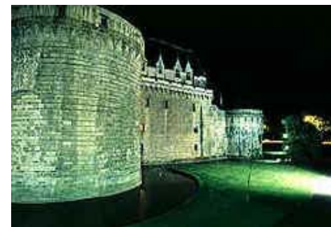
Castle of the Ducs of Bretagne in Nantes

Students should reference http://ipe.washington.edu for more information about Financial Aid & scholarships, including the quarterly IPE scholarship.