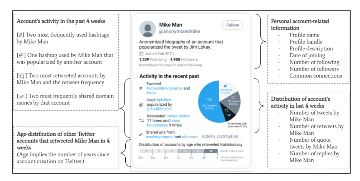
Fig. 2. Representation of a cue card (center) that we showed to a participant. Each cue card is populated with contextual cues specific to the activity of the specific Twitter account in the 4 weeks just before the interview session. The details (left and right) about these cues are mentioned alongside the card. Note that each cue might provide a signal into one or more of the AMPS-based behaviors.

Table 2 describes the different cues that we decided to include in the intervention. For each identified cue, Table 2 also indicates the corresponding problematic behavior enlisted in Table 1. It is possible that each cue can provide a signal into multiple AMPS-based behaviors, e.g., hashtag can indicate what kind of content an account produces and what community it situates within. Figure 2 provides more insight into these cues that we included in the intervention.