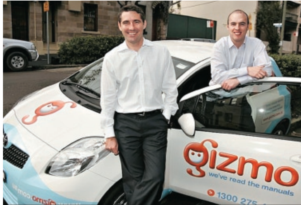
"We've read the manuals" branding on a Gizmo company car.