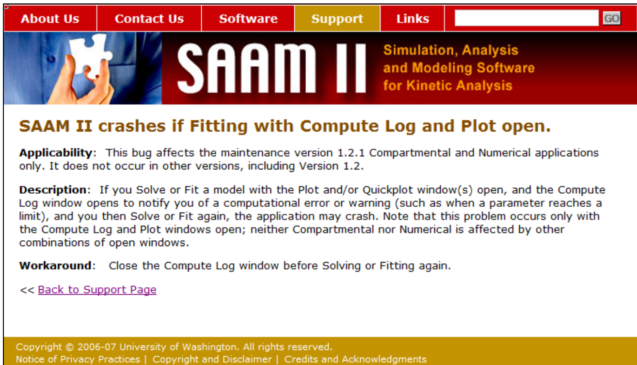
Figure 1. A simple troubleshooting procedure in a help system [3].

Although the main structural pattern is diagnosis followed by resolution, { 14 } at times the diagnosis phase may contain steps for resolution and the resolution content may include diagnosis steps. That is, the procedure may switch the reader back and forth between diagnosis and resolution. Because understanding this diagnosis-resolution structure is the key to understanding troubleshooting procedures, { 15 } I now show how this structure is manifested in a broad range of troubleshooting procedures.