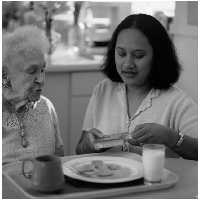
Plate 7.1 Personal support worker helping with the basic activities of daily living

Our account of home care reform draws on textual analyses of a range of policy documents, position pieces by various home care provider stakeholders, Ontario newspapers, and the Ontario Legislative Assembly Hansard 1 that refer to the CCACs and home care restructuring. The four authors are also involved in a large ethnographic study of Ontario homes that have been receiving publicly funded services for people with chronic illness and disabilities. The “Hitting Home” project is a trans-disciplinary, multi-method study investigating various dimensions of long-term care provision in the home. We conducted 17 cases studies of homes across Ontario receiving long-term home care services. 2 The cases included interviews with care recipients, primary family caregivers, and paid caregivers. In this chapter we include excerpts from the 29