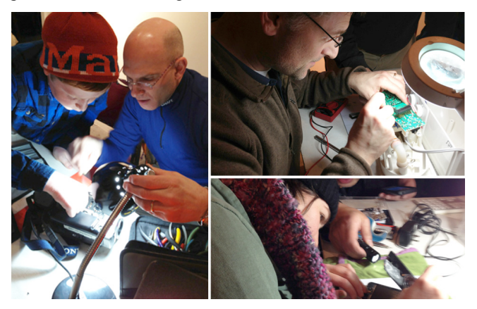
Figure 1: Repairs underway at the Fixers' Collective NYC, March 2015

systems of valuation – including socially coded relations of expertise and sometimes gender – that may also mark and inflect these spaces. Our fieldwork highlights how these processes serve to legitimate certain aesthetics and practices of repair while limiting or undermining others, in ways that both expand and limit the reach and impact of repair practice in such settings.