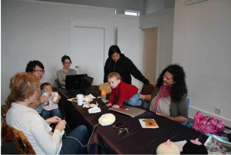
Figure 2. Early HackerMoms gathering.