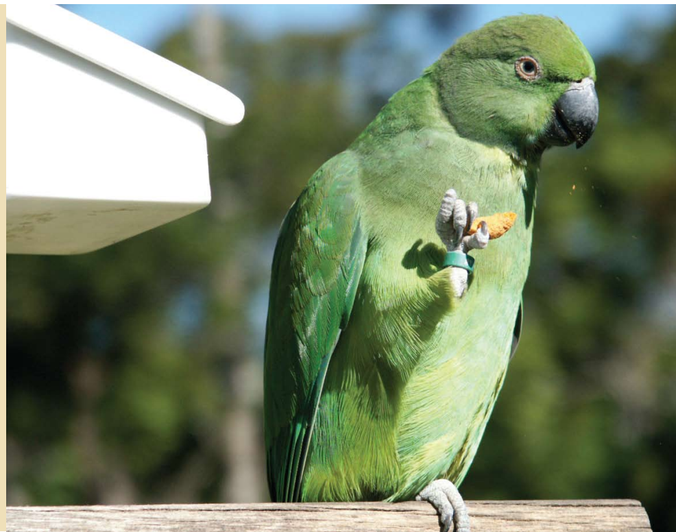
An echo parakeet ( Psittacula eques ) within the captive breeding programme of the Mauritius Wildlife Foundation. The bird was common in Darwin's time but declined to a population of about 10 known birds the 1980s. This is a female, distinguished by her grey beak, which in the males is pink.

In Mauritius, Darwin's virgin forest was again largely wiped out. In the 1970s, thousands of hectares of native forest were cleared and replaced with Florida pine. Unsurprisingly, native forest was precisely the habitat favoured by endemic birds. In the 1980s, the echo parakeet almost became extinct and was only saved by captive breeding. In 1991, the pink pigeon population collapsed down to ten individuals and again was only rescued from extinction by conservationists.