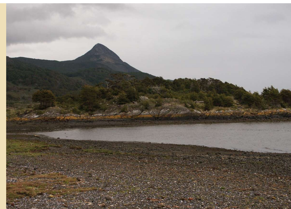
Wulaia, Navarin Island, where Fitzroy landed his three Fuegians.

Ultimately, Darwin's more radical step was to consider humans as just another species within the animal kingdom. On this point, it is interesting to wonder about the views of Augustus Earle, the Beagle's artist from 1831-1832. Earle had already been around the world, and wrote in his 1832 book (bigotedly) of Australian Aborigines as 'the last link in the great chain of existence which unites man with the monkey'. 12 Did Earle ever discuss the relationship of man to apes with Darwin? At the very least, we know that Darwin had read Earle's travelogue. 13