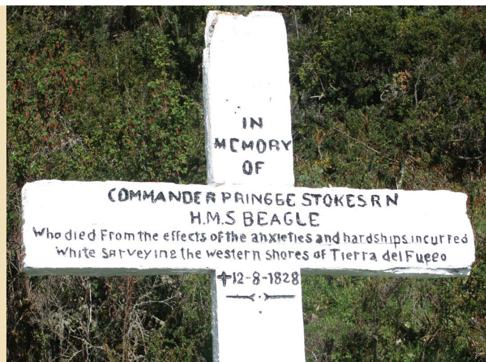
The suicide of Capt Pringle Stokes resulted in Robert Fitzroy taking command of the Beagle on its first voyage and the sequence of events that ultimately led to the Beagle's voyage with Charles Darwin. Stokes' grave, shown here, lies south of Puerto Hambre on the Straits of Magellan, Chile. The cross is a replica; the original cross is now in the Salesian Museum in Punta Arenas.

Farther south still, several different tribes occupied Tierra del Fuego when Darwin visited. FitzRoy wanted to "civilize" the natives with an Anglican mission containing three Fuegians that he had picked up in the previous voyage of the Beagle : a young woman, Fuegia Basket, and two men, York Minster and Jemmy Button. Back in England, these three had been taught English, Christian ways. FitzRoy landed the three Fuegians at Wulaia on Navarin Island together with a missionary, Richard Matthews. But natives stole Matthews' property and made him fear for his life. An almost hysterical Matthews was taken back on board the Beagle , while FitzRoy's three Fuegians later returned to their native ways.