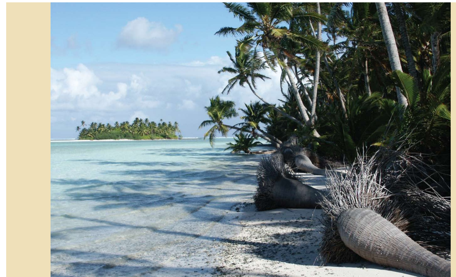
The interior lagoon of Cocos, the atoll that Darwin discusses at length in his theory of coral reefs.