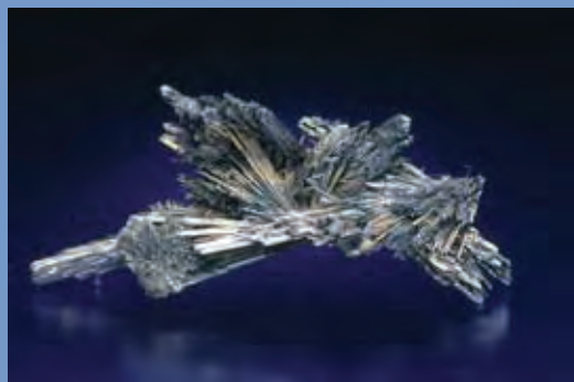
Crystals of the mineral stibnite, a form of antimony sulfide.

Sulfur has the atomic symbol S. It can form several ions. The simplest is sulfide, S^{2-} . This can be oxidised to form sulfate, SO_4^{2-} .