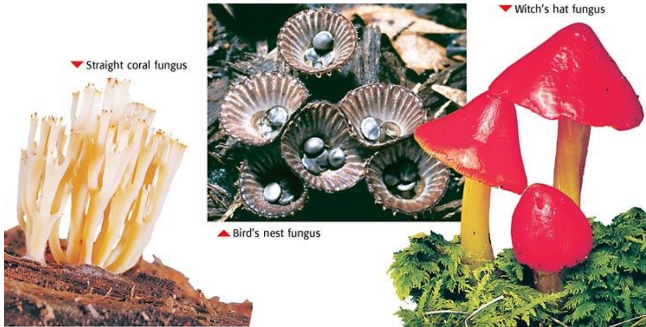
Figure from page 60 of your textbook ( Microorganisms, Fungi, and Plants )