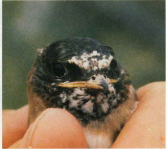
FRONTISPIECE. Faces of six fledging-aged Cliff Swallows. The three on the right are from the same nest.