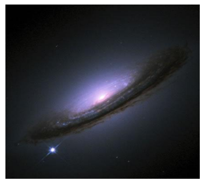
Figure 1. Hubble Space Telescope image of supernova SN1994D in galaxy NGC4526, observed 1994.

The Nearby Supernova Factory (SNfactory) [1] is an international astrophysics collaboration studying supernovae (exploding stars) (Figure 1) in order to learn more about the expansion rate of the universe. The collaboration consists of about 30 members: about half of the scientists work at several different locations in the U.S. and the other half in three research institutes and universities in France. Collaboration members develop software to aid the collection and analysis of supernova data, remotely operate a telescope in Hawaii, and collaborate on scientific research and publications. During each observing night, the telescope is typically operated by a geographically separated group of two to six people. The scientists are in different time zones from each other (France, California, the U.S. East Coast) and from the telescope itself (Hawaii). Some of the team members have never met each other in person, and about half are not native English speakers.