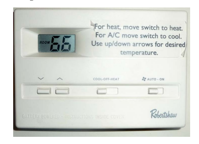
Figure 3. Folk label on a hotel thermostat

For thermostats, one example of folk labeling was the instructional label in Figure 3 on a supposedly simple, non-programmable thermostat in a hotel. It says: "For heat, move the switch to heat. For A/C switch to cool. Use up/down arrows for desired temperature." One might think that the interface was self-explanatory (and thus usable). But the addition of the typed note on the thermostat indicates that enough people were confused by the operation of the thermostat to necessitate the label. In this case, it is difficult to make a judgment on usability and energy consumption; the label only indicates the hotel management's concern for the customers' comfort and ability to operate the thermostat.