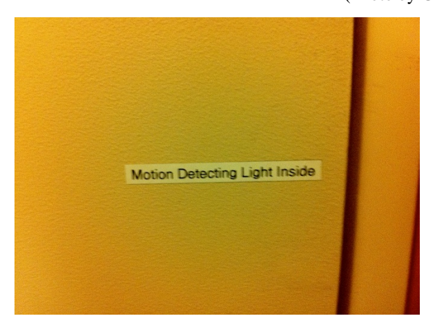
Figure 6. Folk label notifying of the presence of a motion-sensor

Other common labels were for motion-sensing or occupancy-sensing controls, especially for bathroom lights and toilets. Visibility may play a role; if people do not know the device is automatically controlled, they may not understand how to interact with it. One label instructed the person to wave at the toilet in order for it to flush. Other labels informed people of the motion-sensor (Figure 6) or requested that the sensor not be switched off. In general, occupancy-sensing switches do not have a consistent or standard icon that indicates this type of control.