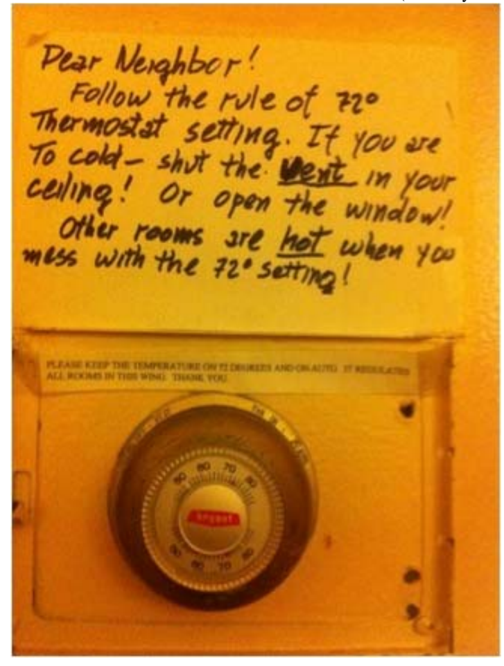
Figure 4. Folk label on a communal thermostat. (Photo by Bret Curry).

Another example of a folk label on a thermostat is in a multi-guestroom facility (Figure 4). There are clearly two different sets of notes on this device. This example shows another common feature of folk labels: its additive nature. Quite often, one person will provide a label and others will add another label presumably to augment or clarify the message. In this case, there is a typed notice about leaving the thermostat at 72F, and then a handwritten note adding more emphasis and reasoning behind the request. Bret Curry writes, "The older dwelling comprises a series of existing residential dwellings converted into a multi guestroom facility. The facility is a non-profit entity provided so families can stay near and support a hospitalized child who is undergoing treatment or hospitalization. Their intentions were noble, but created a comfort, humidity and excessive consumption challenge." This is a case where the folk label could potentially create greater energy consumption. With an older system like this, it is difficult to know whether this is a usability problem or just a deeper problem with the HVAC system in an older building not meant to function in a multi-zone fashion.