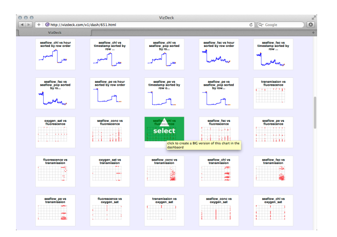
Figure 3: When users hover the top of a thumbnail a green arrow appears. They can click the green arrow to send the thumbnail to the dashboard as a full-sized version.