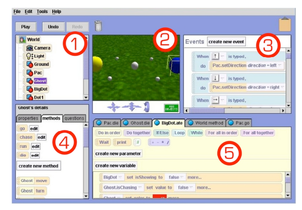
Figure 2. Alice v2.0: (1) objects in the world, (2) the 3D worldview, (3) events, (4) details of the selected object, and (5) the method being edited.

Figure 1. A model of programming errors, showing causal links between breakdowns in programming activities. Breakdowns are defined by combinations of cognitive problems, actions, and artifacts.