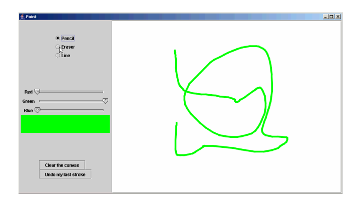
Figure 1. The Paint program that participants enhanced.

result in programming errors [1, 17]. Because interruptions increase the likelihood of such failures, we may be able to develop tools that use models of interruptibility to help reduce programming errors, perhaps by preventing interruptions or by noticing when programmers are interrupted at particularly non-interruptible points in their work and then helping them recover. Programmers also seem to be a good example of knowledge workers whose work involves significant interaction with computers, and so we are hopeful that results obtained with programmers will transfer to other computer-centric knowledge work. While results seem less likely to transfer to office workers who use computers relatively little, we are comfortable with this tradeoff because it seems like the advances offered by sensor-based statistical models of human interruptibility will initially be most relevant to computer-centric workers.