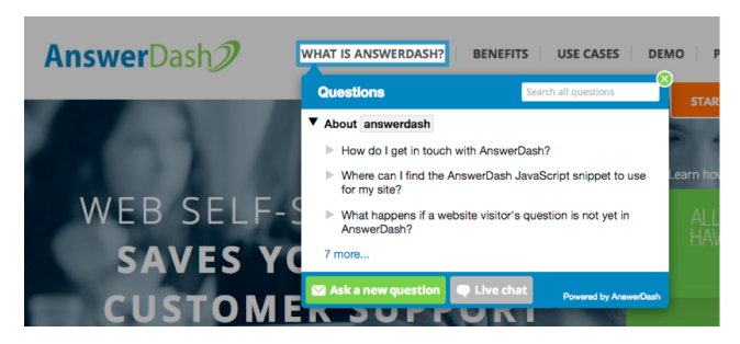
Figure 3: The AnswerDash end user interface showing questions retrieved on a UI element, in this case a link label.

customers, develop a beta product, secure the help of entrepreneurs-in-residence, and attract investors.