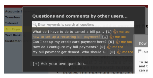
Figure 1. The LemonAid retrieval interface.

difficult to evaluate as they often introduce new platforms or capabilities that do not have obvious benchmark systems for comparison [8,22]. Systems in emerging areas such as social computing face additional intractable challenges—for example, evaluations may be penalized for snowball sampling or for not demonstrating exponential growth [1].