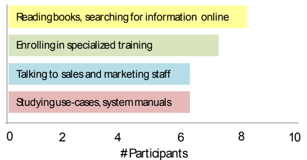
Figure 1: Initiatives for acquiring domain expertise

to build their own expertise in complex domains. These initiatives are summarized in Figure 1. One of these initiatives was particularly striking: a third of the interviewees mentioned enrolling in specialized training on top of their regular jobs to learn about the domain they were working in. For example, one interviewee who worked on electronic measurement instruments explained: